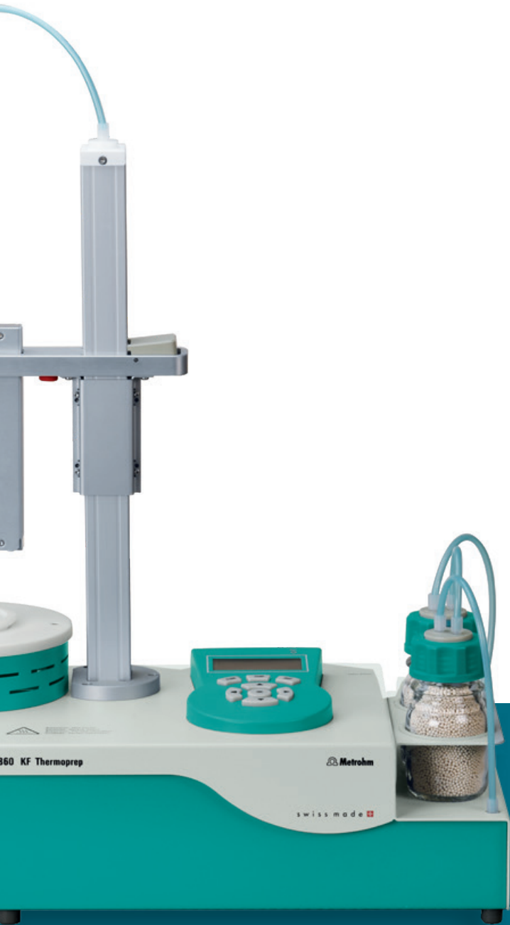
860 KF Thermoprep

The Eco Coulometer is the ideal instrument to perform routine determinations of the water content fast, safely and reliably. Especially, if you don't want to compromise on quality but insist on a competitive price, the Swiss made Eco Coulometer is the solution of choice.