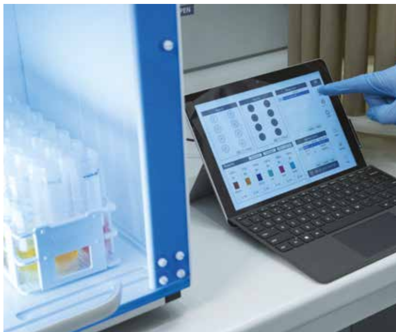
Automatic pre-dilution in 50-mL ICP autosampler vials

Additionally, the easyFILL enables pre-dilution. At the completion of the digestion process, the solutions are transferred into volumetric containers and placed into easyFILL for automatic pre-dilution. This step is commonly done using ICP autosampler vials so that the operator has only to finalise the dilution and bring the solutions to the analytical equipment.