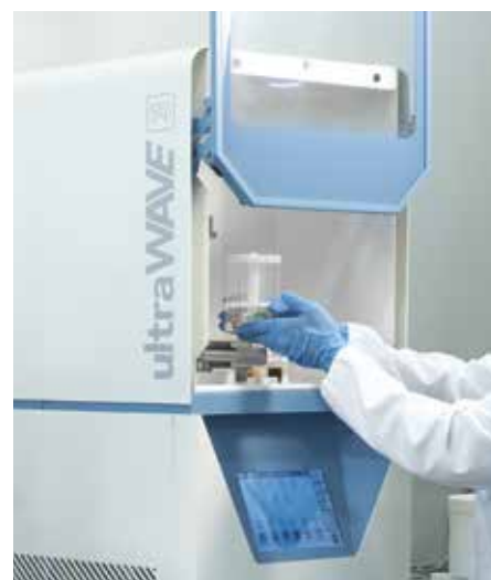
Vessels are ready for the digestion process

Additionally, the easyFILL enables pre-dilution. At the completion of the digestion process, the solutions are transferred into volumetric containers and placed into easyFILL for automatic pre-dilution. This step is commonly done using ICP autosampler vials so that the operator has only to finalise the dilution and bring the solutions to the analytical equipment.