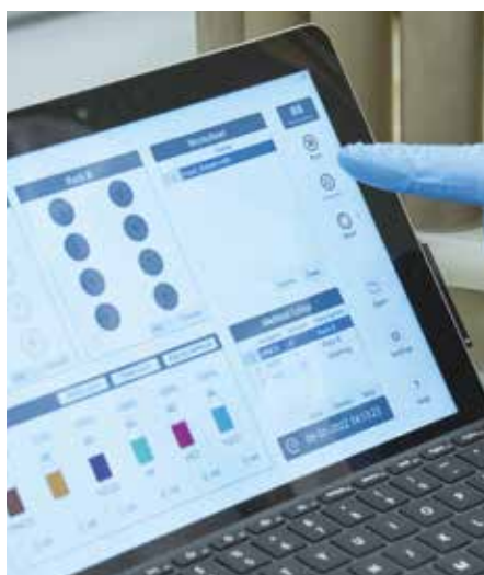
Select the Method and press 'Run'