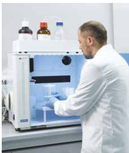
Racks with vessels or vials are placed into the easyFILL

The task of manually adding reagents occupies valuable time of the operator, limiting lab productivity and the ability of the chemist to accomplish other tasks. easyFILL automates these steps, reducing the operator time to just a few seconds.